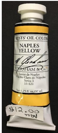
M. Graham Oil Paints 37ml

A professional grade oil paint made with walnut oil.