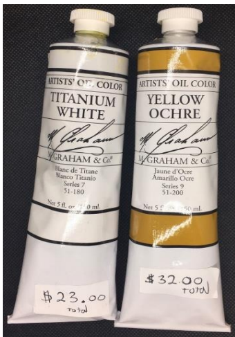
M. Graham Oil Paints 150ml

A professional grade oil paint made with walnut oil.